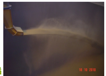
Figure 3: Revised Design

For more information regarding this project or if you wish to make an enquiry, please contact: