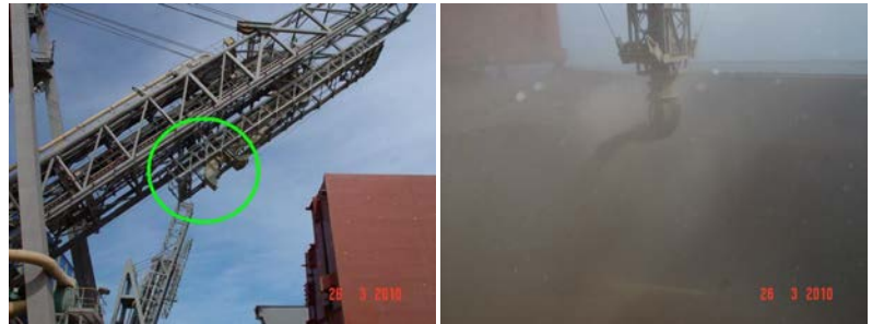
Figure 1: Existing Design and Dust Emission Observed

Conceptual re-design of existing ship loading chute was performed within structural and geometrical constraints, notably limited head height (under 2.0m) and slew ring located above.