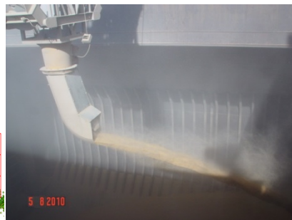
Figure 2: Prototype

Design based on minimising impact angle and maintaining dust encapsulated within a fast moving material stream. Analysis performed utilising a continuum approach in parallel with Discrete Element Modelling (DEM).