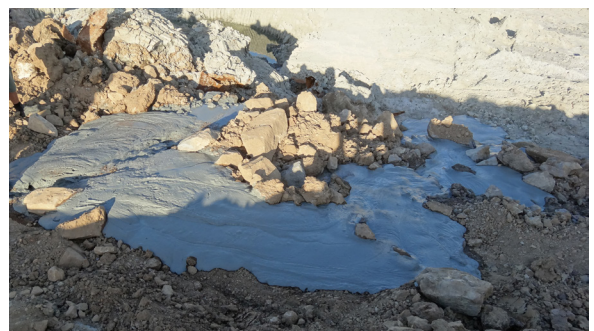
Figure 5: Placed Sediment in Shore Landfill

It was demonstrated that marine sediment could be excavated from the bottom of a harbour, mixed and pumped to a disposal area on shore over a distance of 100 meters. No additional water had to be added to pump the paste and when placed on shore, the deposited sediment produced no supernatant water.