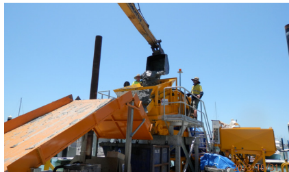
Figure 3: Backhoe Loading Feeder