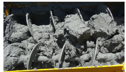
Figure 4: Sediment in Twin Screw Feeder