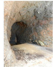
Figure 2: Arching and ratholing on site

The ratholing, arching and blockage as observed on site is shown in Figure 2. Due to client request, conceptual re-design was restricted to not modifying existing geometry which included the feeder/breaker.