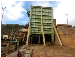
Figure 1: Existing hopper, feeder and breaker

A flat bottomed road receival hopper, acting as the entry point to a nickel ore handling facility, was observed to arch and rathole. This resulted in sporadic flow (surges), blockage and ultimately costly downtime for the client. The existing hopper and feeder/breaker arrangement (hopper floor) is shown in Figure 1.