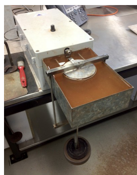
Figure 1: Direct Shear Tester with submerged Cell

Problem: Historically, mineral sand surge bins were designed without considering the mode of flow within the bin. The mode of flow was inevitably funnel flow where the slurry moved down a central channel "rathole" to the discharge point. This resulted in an inconsistent slurry density at the discharge and reduction of process efficiency. In addition, bins "rathole" resulted in particulate solids slumping causing blockages.