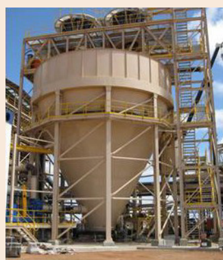
Figure 2: A Surge Bin in Service

essential elements illustrated in Figure 3. TUNRA and Mineral Technologies have designed units ranging in size from 5 m 3 to 1150 m 3 which are marketed as Lyons Feed Control Units.