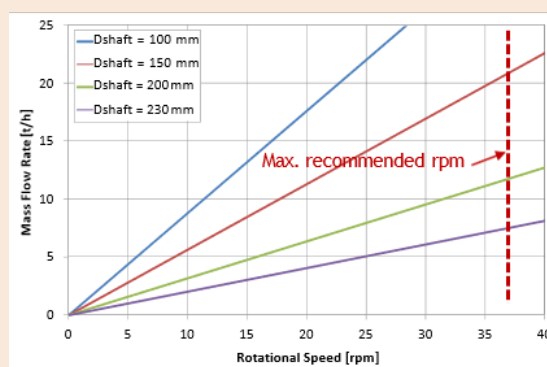
Figure 2: Calculation of the operative curve for a rotart valve with 350 mm diameter